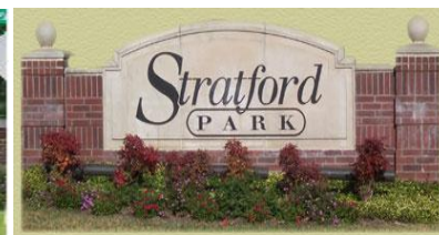
Stratford Park 3 rd Place

The District would like to thank the residents of Fort Bend County MUD No. 25 for the much needed donations. We are pleased to report the residents of Fort Bend County MUD No. 25 donated 307 bags of food to the East Fort Bend County Human Needs Ministry – 8% resident participation – from our 2015 Summer Food Drive. Let's strive for 13% (200 more residents) participation! Neighbors helping neighbors is the foundation of the District Community Heartlines program. With your continued efforts and support, your neighbors will not go hungry.