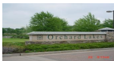
Orchard Lakes Estates 1 st Place