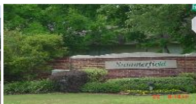
Summerfield 2 nd Place