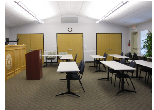
Spacious room allows for layout versatility to fit your needs