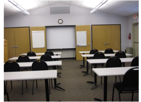
Audio Visual Equipment includes a projector with pull down screen and writing boards